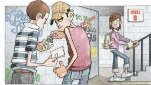
Article 33: You have the right to protection from illegal drugs

When can CRWIA help with improvement planning?