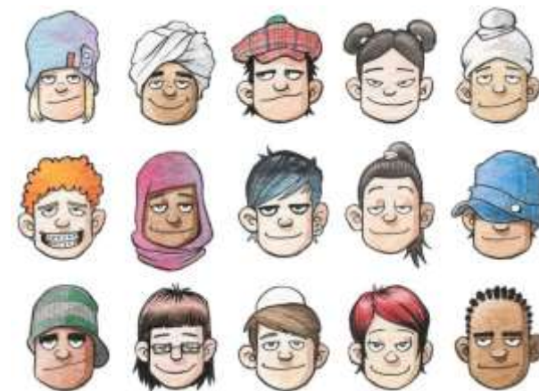
Article 1: Rights for everyone under 18

Who is Scotland's Independent Commissioner for Children and Young People and what is his role?